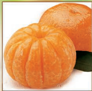
November Mandarin Oranges

Always have delicious, fresh citrus in your home, ripe and ready to enjoy. Choose a 2, 4, or 6 month plan and select the amount of fruit you wish to receive. A fresh variety will arrive every month!