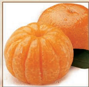
March Mandarin Oranges