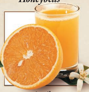
April Valencia Oranges