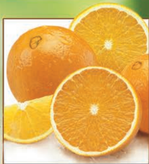
December Navel Oranges