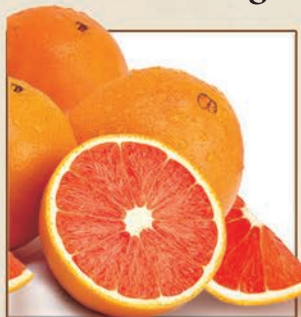
February Scarlet Navels